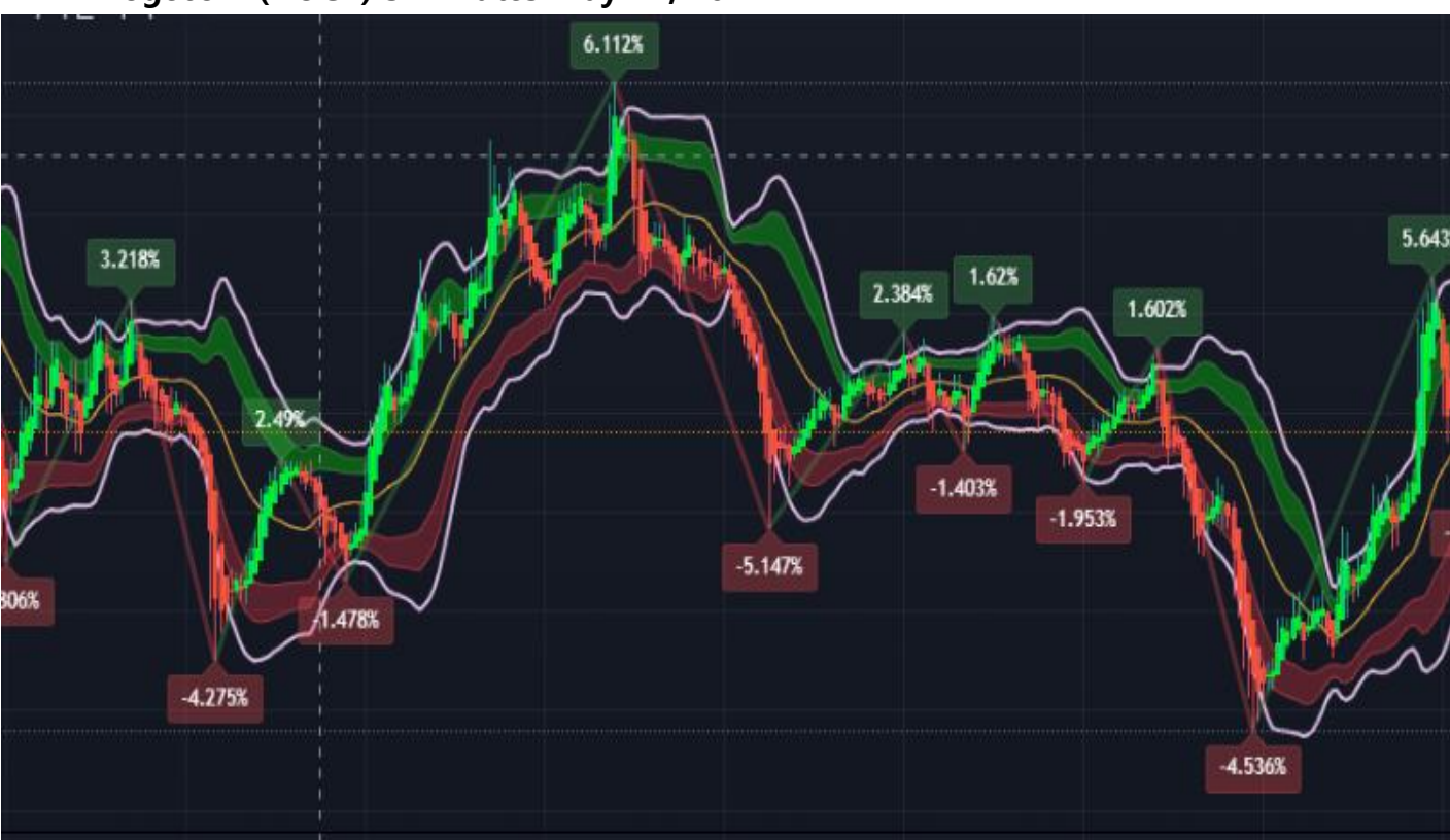
• Dogecoin (DOGE) 5 minutes May 22, 2024