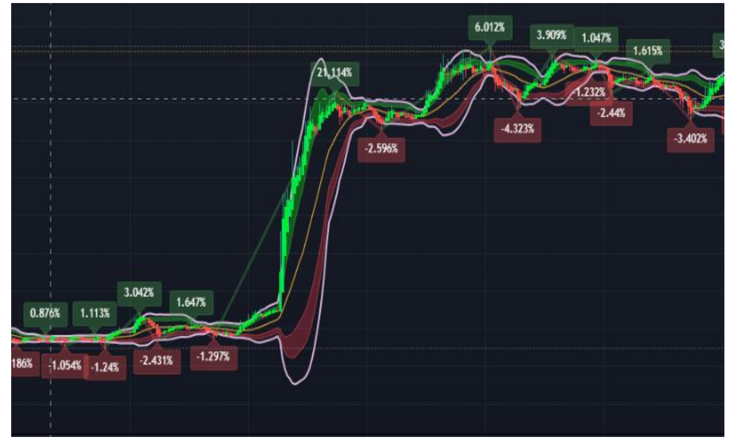
• Ethereum (ETH) 5 minutes May 22, 2024