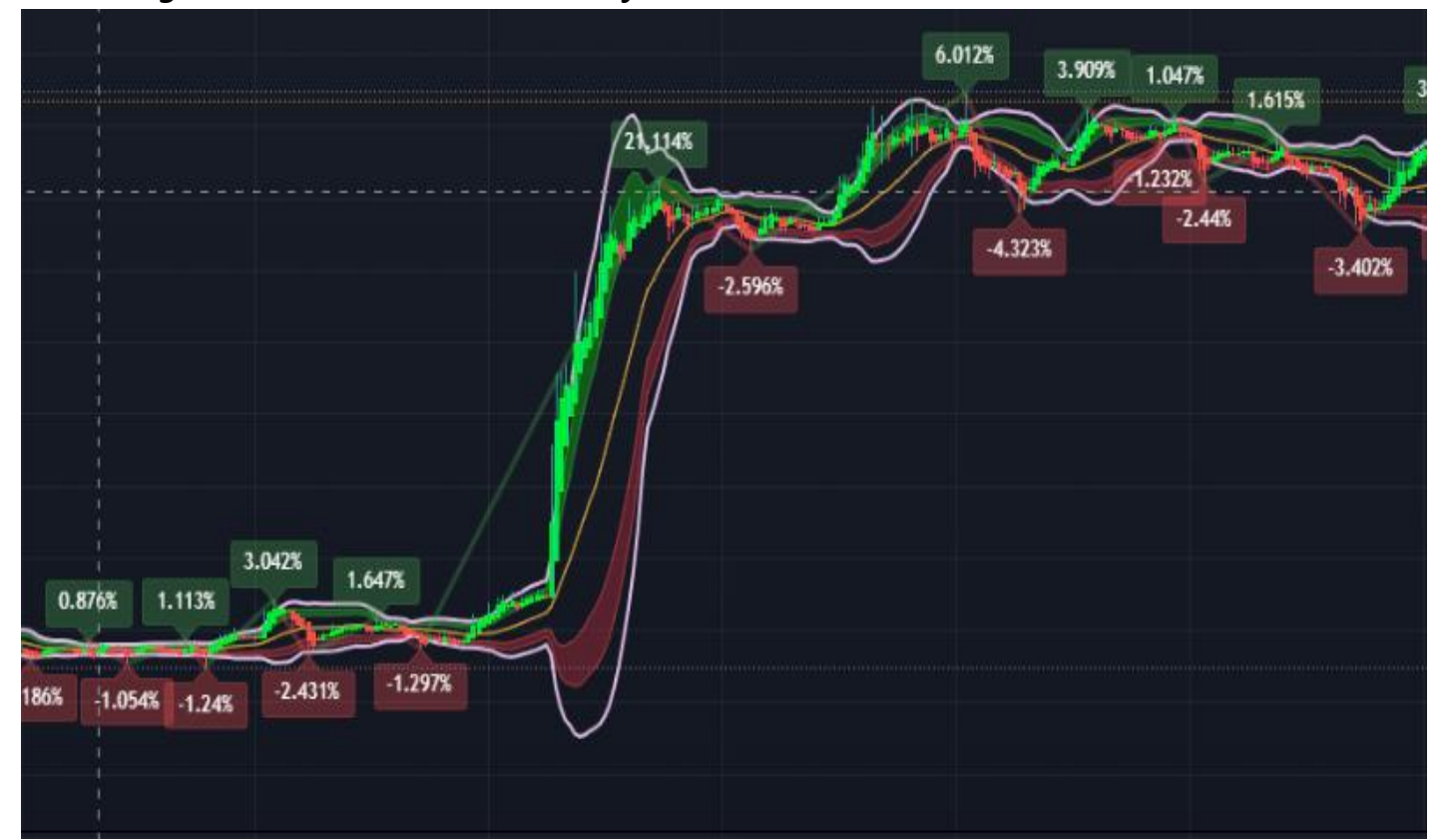
• Dogecoin (DOGE) 15 minutes May 20-22, 2024